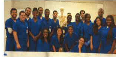
Photo: Motivation Class of 2014

http://diversity.med.miami.edu/summer-programs/mshcmp