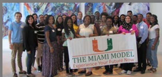
2015 High School Careers in Medicine Workshop A seven-week interactive curriculum gave these high school seniors a firsthand introduction to topics related to the study of medicine and other health fields.