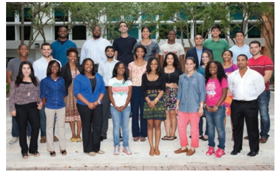
These college juniors and seniors, who are planning to take the MCAT, participated in a seven-week medical school experience through the University's 2012 Medical College Admission Test Preparation Program .

"The program offered me so many opportunities that, at times, the most difficult aspect was deciding which to take advantage of that week. The work was vigorous, the studying was long, but the program provided one of the most valuable experiences I have had to date!"